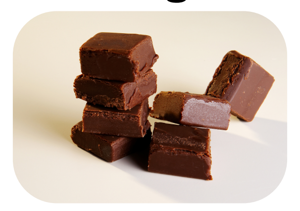
A confection made by mixing sugar, butter & milk then heating it and cooling it.