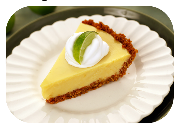
A pie made with lime juice, egg yolks and sweetened condensed milk with a graham cracker crust.