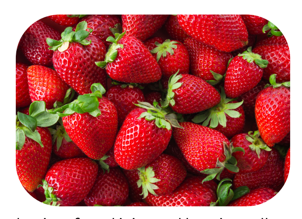
A small red fruit that is soft and juicy and has tiny yellow seeds on its skin.