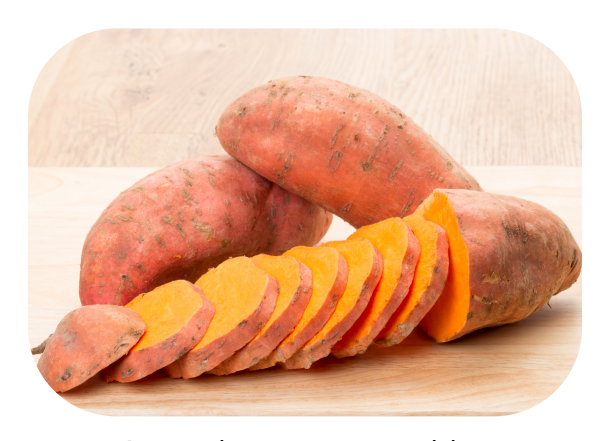
A starchy, root vegetable.