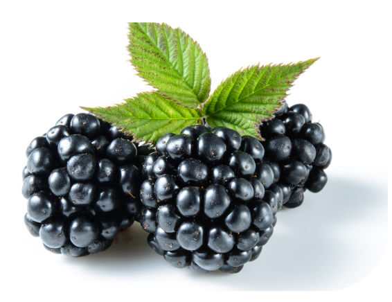
A small, dark colored fruit known for its tart flavor.